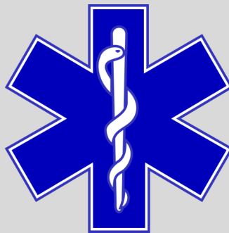
Clinical Saves & Star Of Life Awards