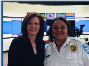
Charity & Public Relations Events

Standbys For Blues, Cardinals, Community Events, & Concerts